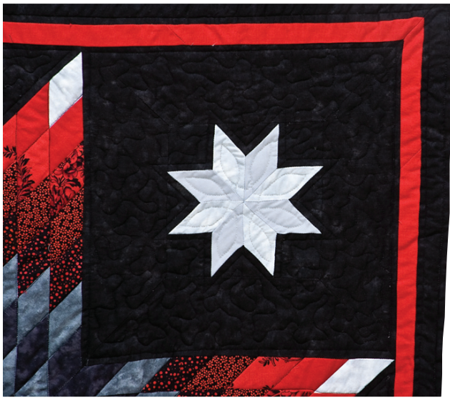
Small background star

When choosing the fabrics for the diamond layout, use tone-on-tone prints, marbled fabrics, or solids rather than multicolored prints that will distract your eye from the pattern as a whole. It is also important that you choose four distinct values of the four red fabrics in the star points to keep the quilt from getting a big mass of red circling the star.